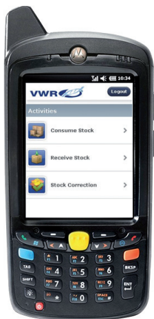
Mobile scanning solution